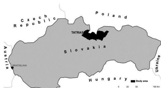
Figure 2: Position of Tatra Biosphere Reserve within Slovakia