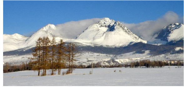
Photo 1: Gerlachovský štít, the highest peak of Tatra National Park, as well as Slovak Republic

The manifold color of the territory is enhanced by preserved features of traditional folk culture. The folk culture and folklore of this region have many things in common, but they also differ significantly from neighbouring regions in Poland and Slovakia. These differences are manifested in folk costumes, folk clothing, music, dancing and singing.