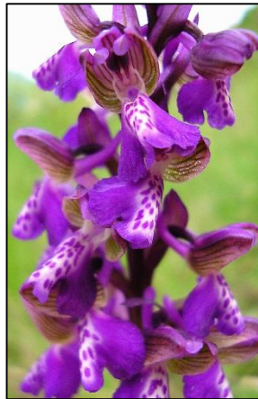
7. Dactylorhiza majalis 8. Orchis morio