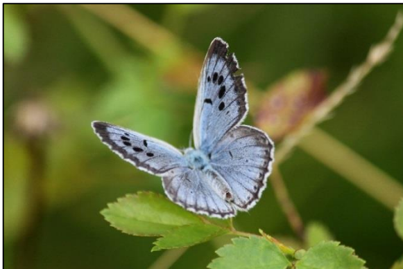
9. Maculinea arion