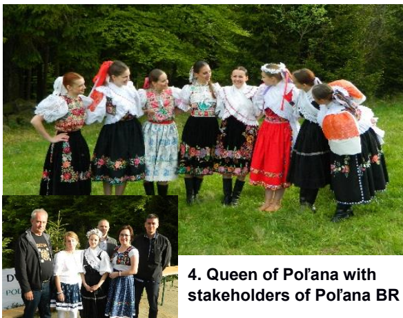
4. Queen of Poľana with stakeholders of Poľana BR

Queen of Poľana – The one part of the Open Day of Poľana BR is traditional competition "Queen of the Poľana". It is the challenge to choose women from region who will personify the values of Poľana BR. The competition is not about physical beauty or age. It is about the